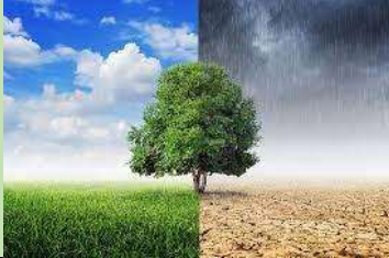
Weather and Climate